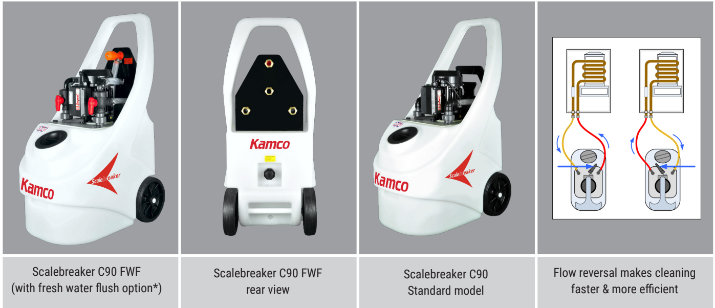
Scalebreaker C90 FWF (with fresh water flush option*)

Built to handle the strongest descaling chemicals